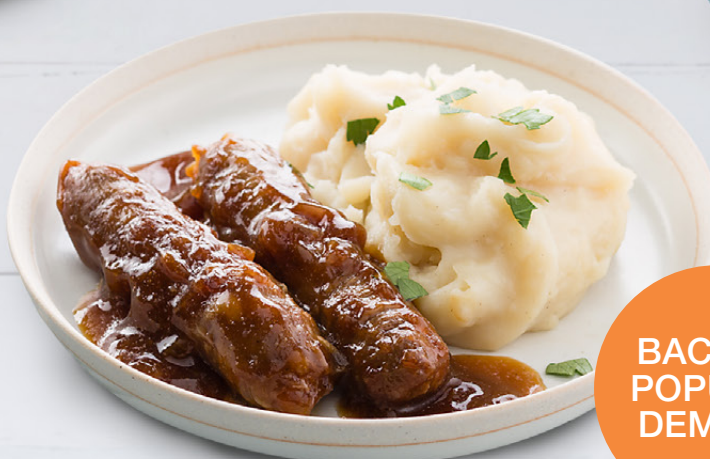
Bangers & Mash