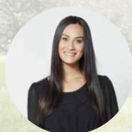
BY LAURA FORD ACCREDITED PRACTISING DIETITIAN

Over winter it's natural for many of us to go into hibernation as we spend more time getting cosy on the couch and less time on physical activity. As the weather gets warmer and days get longer, you may find an increase in energy levels and more motivation to get active again. While signing up for the gym is a great way to encourage activity, there are plenty of other ways to get moving that are fun (and free!). Here are our top tips for ways to get more active.