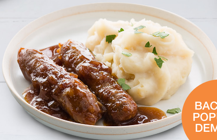
Bangers & Mash