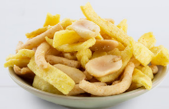
Trio Spice Snack Mix