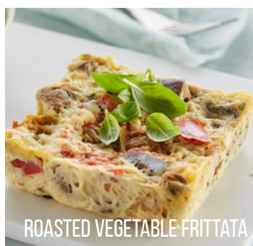
ROASTED VEGETABLE FRITTATA