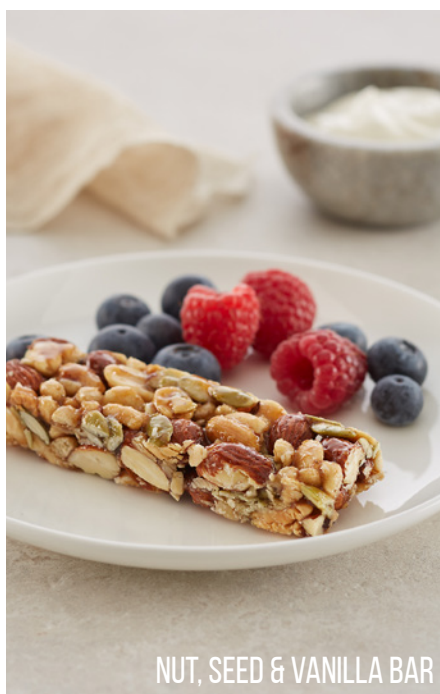
NUT, SEED & VANILLA BAR