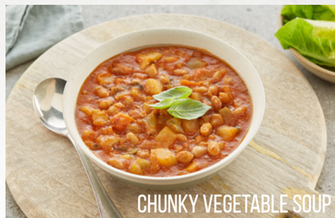
CHUNKY VEGETABLE SOUP