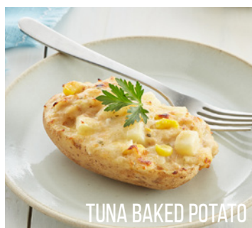
TUNA BAKED POTATO