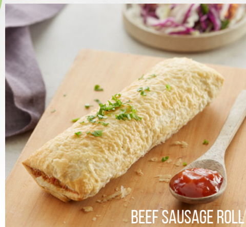
BEEF SAUSAGE ROLL