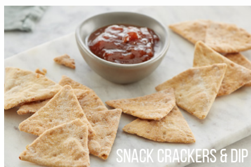
SNACK CRACKERS & DIP